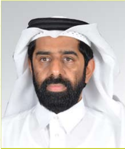
H.E. Dr. Saleh Mohammed Al Nabit